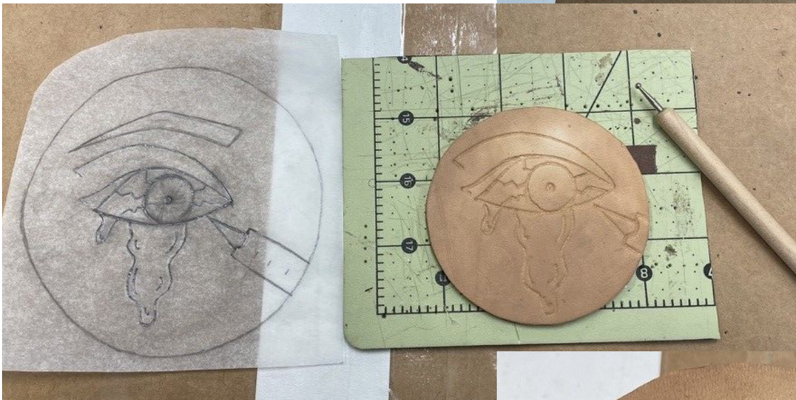
Sketching & Etching